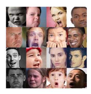
Figure 1. Candid face samples of various poses. Table 3. Performance of the baseline approaches on our CIFE dataset vs on CK+